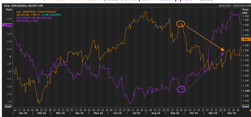
GPR 250 REIT Index versus US 10 year Treasury yield – 2016

The below chart of the GPR 250 REIT Index (orange) and the US 10-year bond yield (purple) reflects the 4 th quarter divergence.