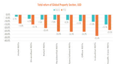
Source: Reitway Global, Refinitiv Datastream, Sept 2022

Looking at sector returns, while hotel and diversified shares declined between 3.1% and 6.5%, they were the best performers during 3Q22.